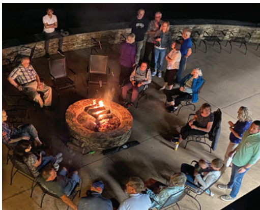
Informal time around the outdoor fire pit provided a chance for staff members to engage with one another in a relaxed setting.

Much later in Moses’s story we find him speaking with God face-to-face as one speaks with a friend. Not only that, but with a boldness not found with those who are unfamiliar in relationship, Moses asks God to show him his glory. How does one go from hiding one’s face in shame to the bold request of asking