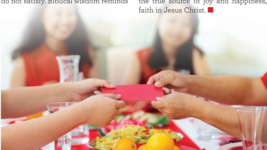
Families, friends, and employers give monetary gifts in red envelopes.

We pray that this year will be the year when COM’s Chinese friends discover the true source of joy and happiness, faith in Jesus Christ. ■