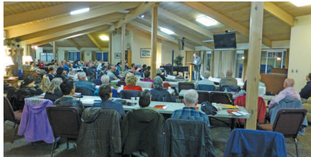
Staff gather for worship and fellowship at the 2017 COM Staff Conference

my chest as I realized that after three long years, this is truly where God wanted me. I have been following His light all this time, waiting, making trips to China, exploring different career paths and searching for how I could serve the Chinese somehow and this is where He had led me. Until that moment, it did not feel real. Until that moment, I felt like it was all a dream. This year, teaching has been taking nearly all my time. But at that moment, I was at peace and knew my place. I felt the energy of all the things I will be able to do for the people I will meet. I cannot wait to get started! ■